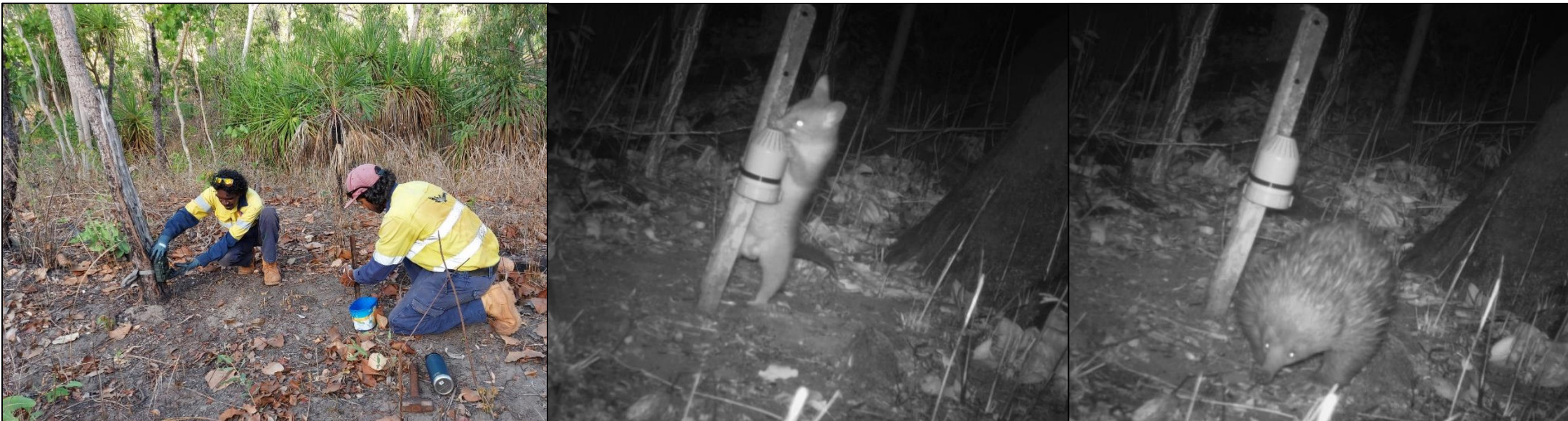
Left to Right: Gulkula staff deploying camera traps, a northern brushtail possum, and a short-beaked echidna.

Prior to clearing land, camera traps are set up to detect and monitor the presence of fauna and thus evaluate impacts and actions to mitigate the same. Presence-absence sampling surveys are also undertaken to determine the presence of endangered, vulnerable, or threatened (ENVT) flora. During the reporting period, Gulkula undertook pre-clearing fauna surveys and a targeted botanical survey for the NT endangered species Erythroxylum sp. Cholmondely Creek. No ENVT flora or fauna species were recorded.