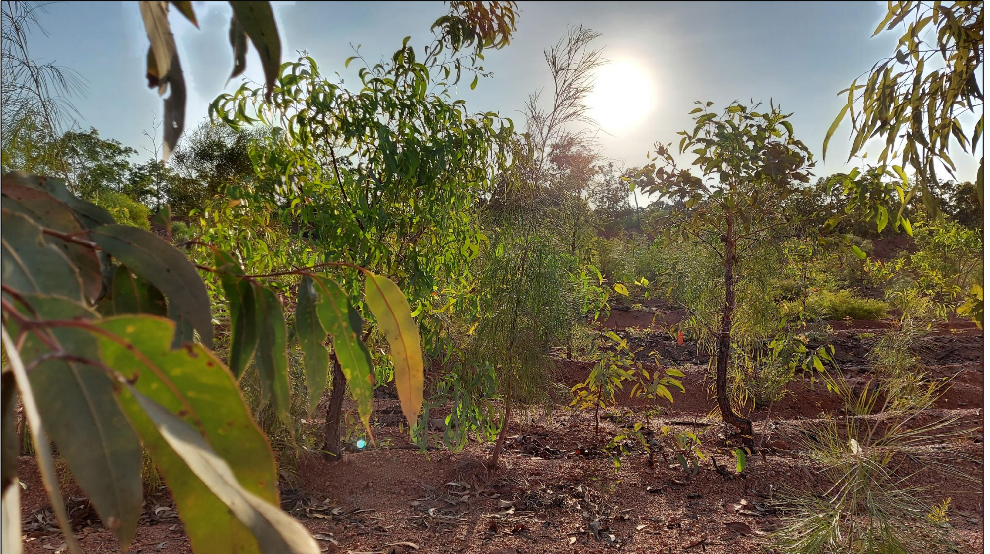
Image of 2018-19 mine rehabilitation.